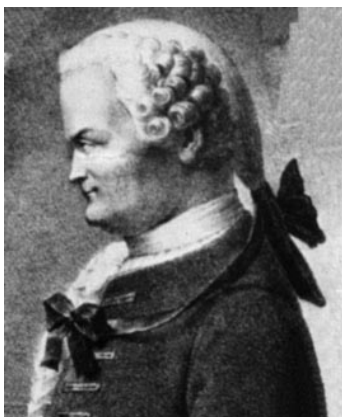
Johann Heinrich Lambert

These definitions are discussed in the context of the Lambert W function, which is the inverse of the function f(z) = z*\exp(z) .