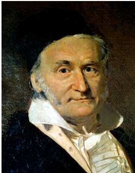
Carl Friedrich Gauss

Abstract: Given a nonzero integer d we know, by Hermite's Theorem, that there exist only finitely many cubic number fields of discriminant d . A natural question is, how to refine the discriminant in such way that we can tell, when two of these fields are isomorphic. Here we consider a certain binary quadratic form q_K associated with our cubic extension, and we show that if d is a positive fundamental discriminant, then the isomorphism class of q_K , as a quadratic form over \mathbf{Z}^2 , gives such a refinement.