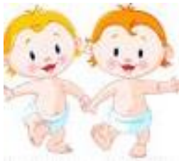
Baby-giant steps in computing